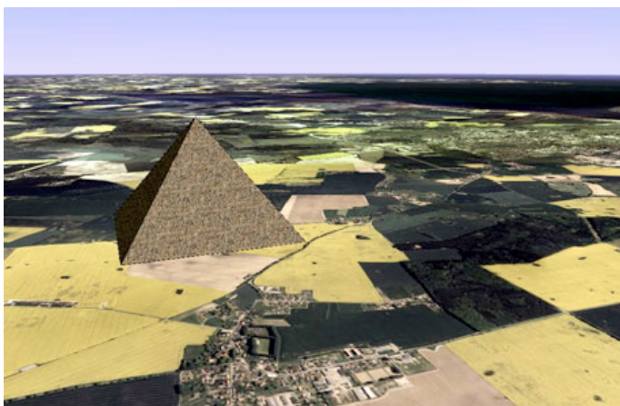
Image of proposed Great Pyramid of Germany